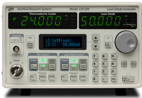
LDC500 front panel

The LDC500 series offers an auto-tuning feature which automatically optimizes the PID loop parameters of the controller. Of course, full manual control is provided too. Dynamic transfer between CT and CC modes for the TEC is also easy — just press the Temp/Current button.