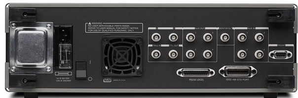
SR810/830 rear panel