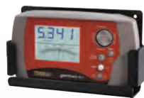
Wall Support (Model Number: 201241)