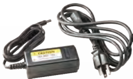
Additional 9V Power Supply (Model Number: 200960)