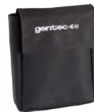
Protective Pouch (Model Number: 200128)