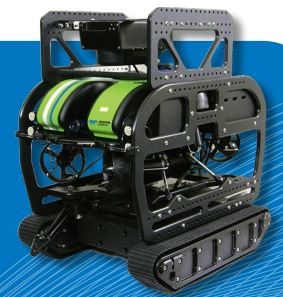
vLBC System Views