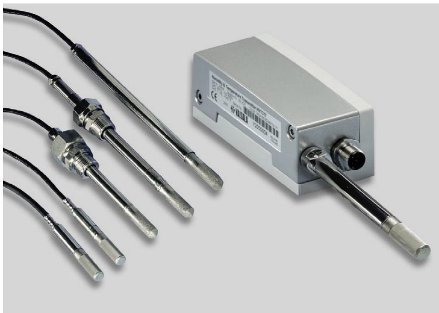
The Vaisala HUMICAP® Humidity and Temperature Transmitter HMT310 models (from left to right): HMT313, HMT317, HMT314, HMT318, HMT315 and HMT311.