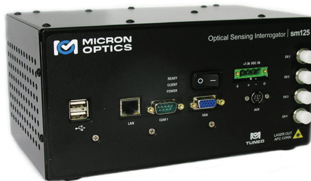
sm125 Field Module

The small, accurate, powerful, and economical sm125 combines an industrial PC with Micron Optics' robust, high-power, low-noise swept laser source. Micron Optics interrogators are installed in hundreds of applications in harsh environments around the world from oil platforms in Brunei to marine vessels in the North Sea to tunnels in Japan.