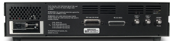
SR400 rear panel