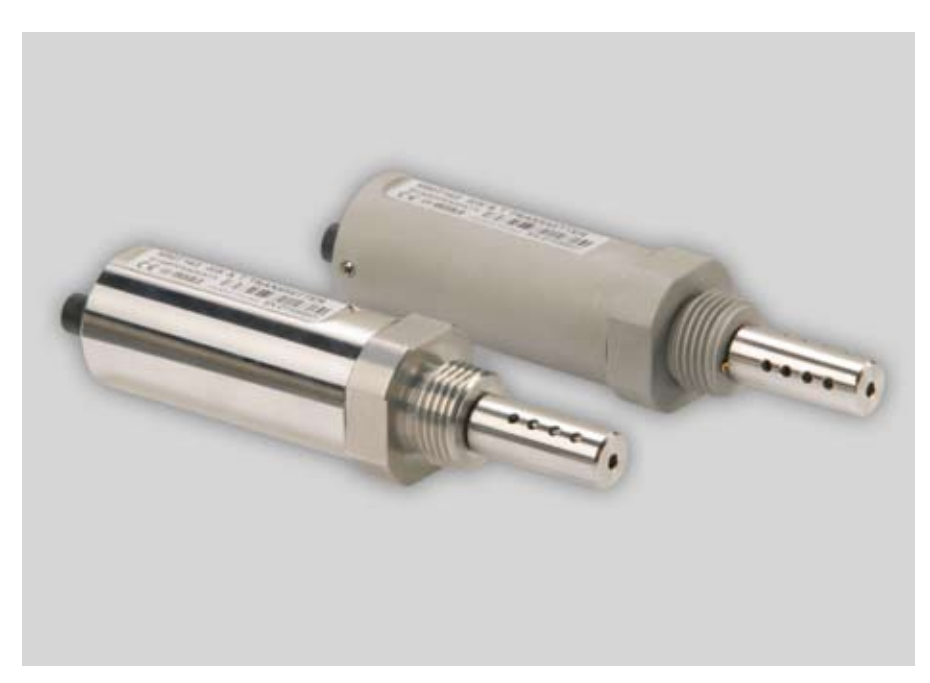
The MMT162 enables on-line moisture monitoring in oils even in the most demanding applications.