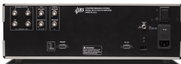
SR124 rear panel