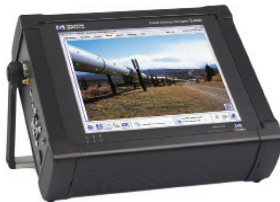
si325 Portable Instrument

The "si" in the Micron Optics si325 interrogator name indicates that it is a "Sensing Instrument" (not an "sm", or "Sensing Module"). The si platform uses an MOI optimized integrated ENLIGHT Pro environment built upon Windows XP Embedded technology. This facilitates on-board management of all x25 optical core settings, data acquisition, sensor calibration, data visualization, and data storage. Users of Integrated ENLIGHT Pro interface to the si through a touchscreen LCD, external keyboard/mouse/monitor, or Windows Remote Desktop connections.