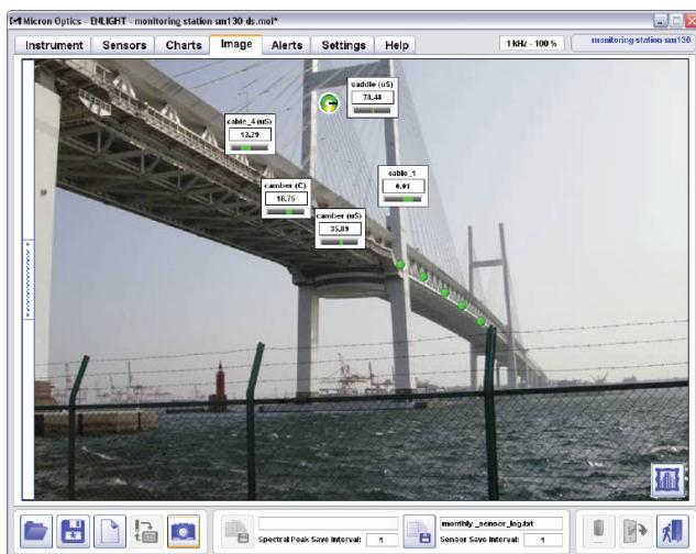
View structure status.