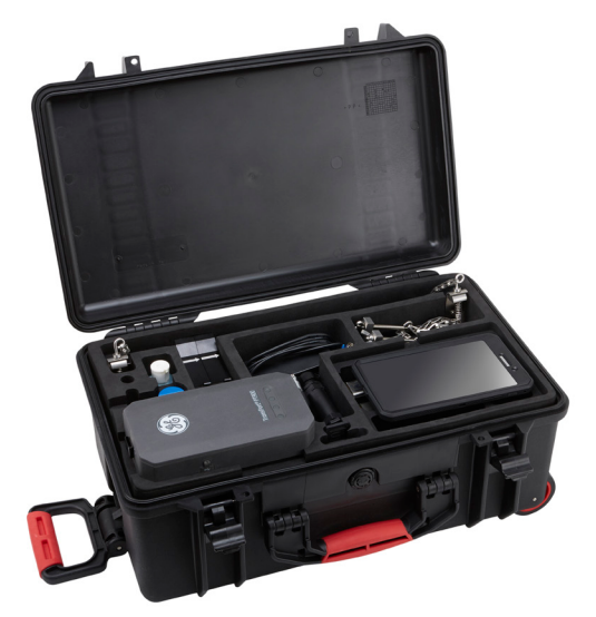
Optional Hard Shell Carrying Case