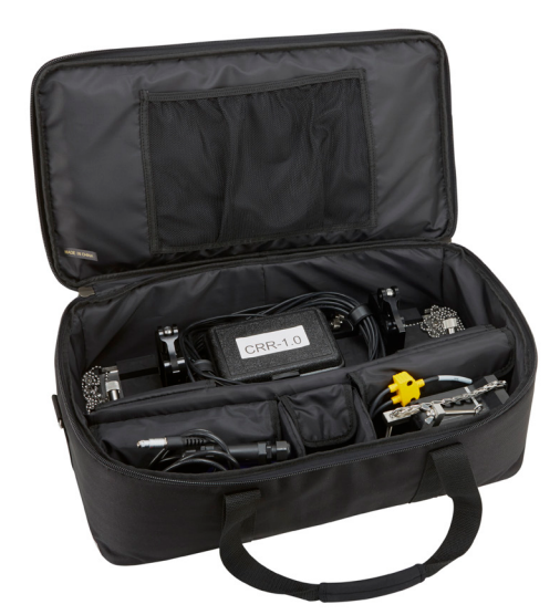
Standard Soft Shell Carrying Case