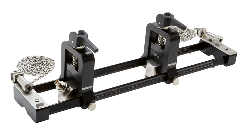
Clamp-On Fixture with CRR Transducers