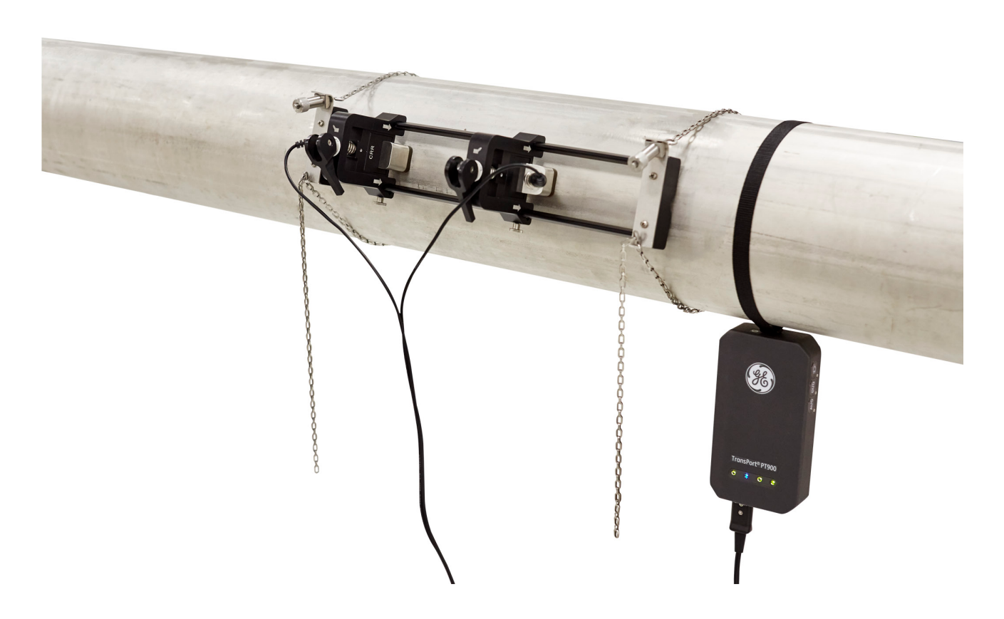
Clamping Fixture, Transducers and Transmitter Mounted on Pipe