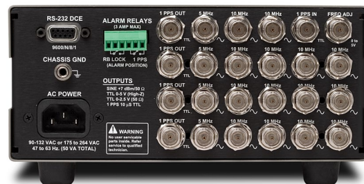
FS725 rear panel (with Opt. 03)