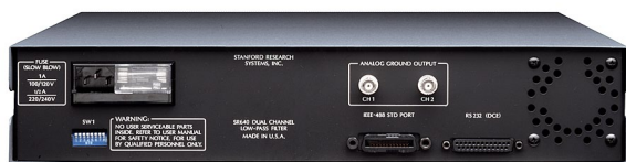
SR640 rear panel