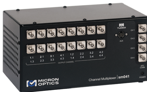
sm041 Channel Multiplexer

The sm041 Sensor Multiplexer is a compact, field proven, industrial grade multiplexer module that conveniently and economically adds measurement channels and fiber connections to an interrogator core. The switch-type sm041 multiplexer is based upon the latest generation of solid state optical switches that redirect the optical path without moving parts. These switches feature low insertion loss, fast response time, high extinction ratio, and extremely high reliability and repeatability. The coupler-type sm041 multiplexer is based upon a network of fused wide band fiber optic couplers and share a common optical spectrum simultaneously among multiple output ports. Both versions are designed to meet the most demanding requirements of continuous operation without wear-out, longevity without fail, and live operation under vibration and shock.