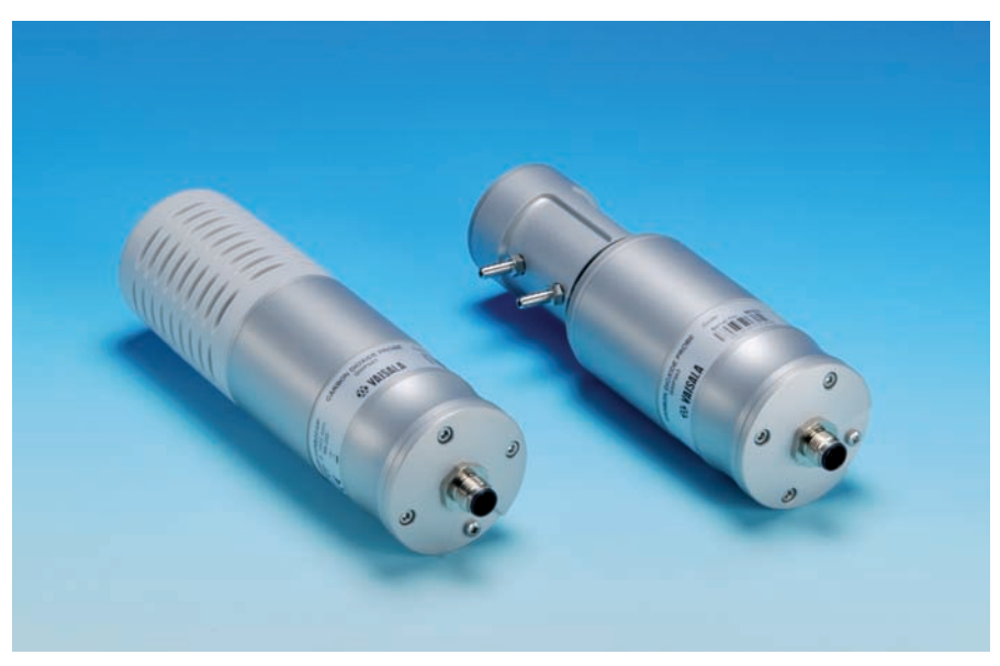
The GMP343 is available as an open path, diffusion aspirated model (left) and as a flow-through model (right).

environments. The sensor's diffusion filter protects it from dust and dirt.