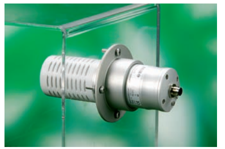
With the optional mounting flange, the GMP343 can for example be installed directly into a soil respiration box. The diffusion-aspirated probe eliminates sampling systems and errors related to pressure differences caused by pumps.

Each GMP343 is calibrated using ±0.5 % accurate gases at 0 ppm, 200 ppm, 370 ppm, 600 ppm, 1000 ppm, 4000 ppm and 2 %. Calibration is also done at four temperature points, -30 °C, 0 °C, 25 °C and 50 °C. If needed, the customer can recalibrate the instrument using the multipoint calibration (MPC) feature allowing up to 8 user-defined calibration points.