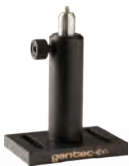
Stand with Steel Post (Model Number: 200160)