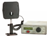
SDC-500 Digital Optical Chopper