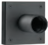
THZ12D-3S-VP (3W-Volume Absorber)