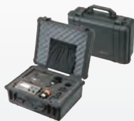
Pelican Carrying Case