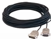
Extension Cables (4, 15, 20 or 25 m)