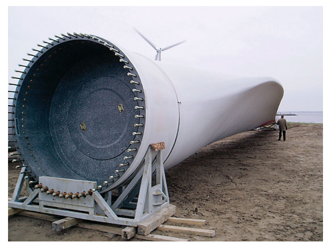
Rotor blade NDT inspections with Shearography

Shearography has been incorporated in ASNT standards since 2006. NAS 410 Certified since 2008. (SNT-TC1-A, and CP-105). ASTM standard (ASTM E2581) defines how to inspect composites with shearography. Laser shearography has been approved by leading suppliers in the aerospace, automotive, wind turbine and other industries.