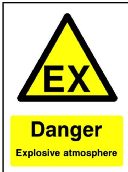
Fig. 2. Example warning sign.