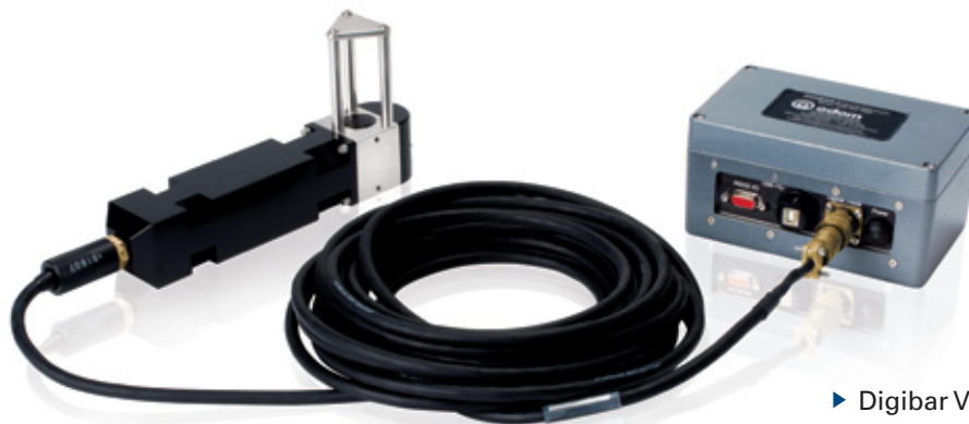
► Digibar V with Junction Box