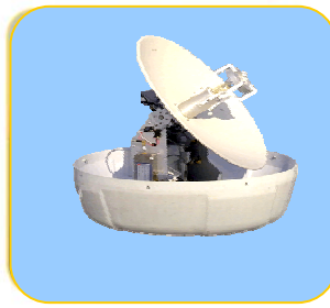
Precision Farming Antenna Stabilization

The MEMSIC AHRS380ZA integrates highly-reliable MEMS 6DOF inertial sensors and 3-axis magnetic sensors with extended Kalman filtering in a miniature factory-calibrated module to provide consistent performance through the extreme operating environments in a wide variety of dynamic control and navigation applications.